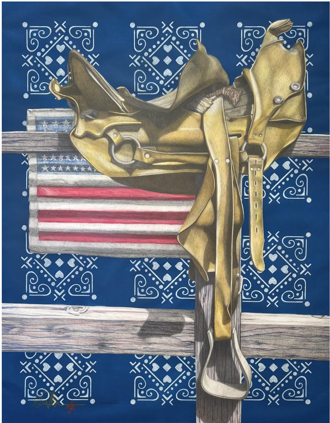
David Mason 'Folk Art' , 30x24 inch , color pencil, acrylic, and graphite